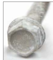
UltraCon SS4 anchor