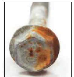
ITW Tapcon 410 SS anchor